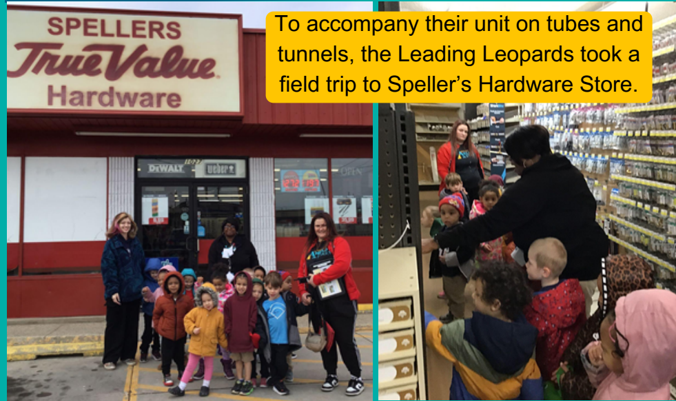
To accompany their unit on tubes and tunnels, the Leading Leopards took a field trip to Speller's Hardware Store.

This month many classrooms are beginning to prepare children for kindergarten transitions. You can help make your child's transition to kindergarten seamless. Talk to them about school changes and how learning is fun. Visit your library and explore kindergarten books so your child will be ready for their new education journey.